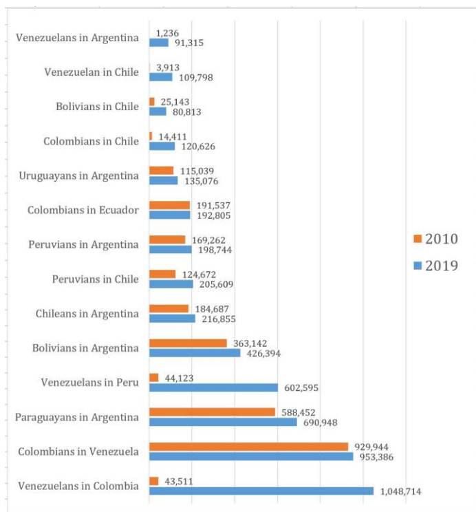
Largest intra-regional migration stocks 2010 and 2019